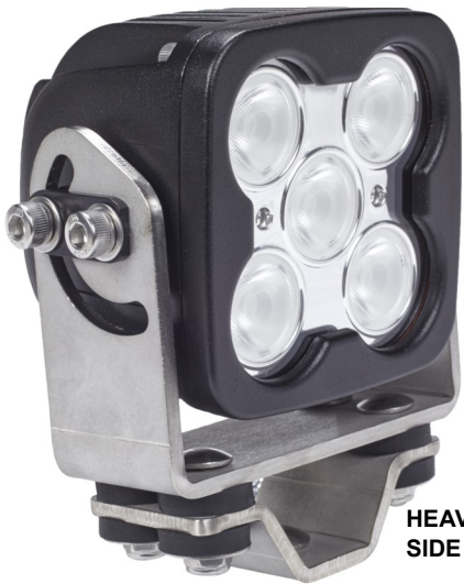
HEAVY DUTY SIDE MOUNT

The HD Work Series 50W light features revolutionary high output optics that produce optimum light levels with high quality Cree 10W LED's.