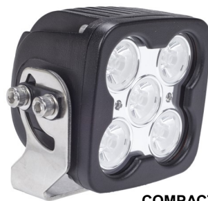
COMPACT SIDE MOUNT